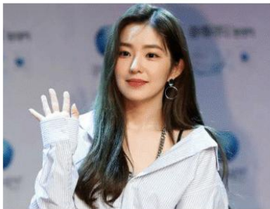
K-Pop girl group Red Velvet on Monday released its extended play titled "Cosmic" ahead of its 10th anniversary.

Red Velvet will be coming to Manila for a fan concert on September 14, to be held at the Mall of Asia Arena.