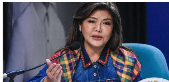
Sen. Imee Marcos' friendship with Vice President Sara Duterte remains intact despite the latter's recent tirades against President Ferdinand Marcos Jr. and remark that she will exhume the remains of the Marcos patriarch, the President's sister said.

'does not know how to be president' Sen. Marcos added that she did not get upset with Duterte for saying her brother does not know how to be a president nor for threatening to dig up Ferdinand Marcos Sr.'s remains at the Libingan ng mga Bayani if "political attacks" continue.