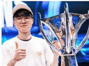
South Korean giants T1, led by "Faker", won their fifth League of Legends world championship crown in London on Saturday, beating China's Bilibili Gaming in a thrilling final.

South Korea have traditionally been a League of Legends powerhouse but in recent years Chinese teams have been growing stronger.