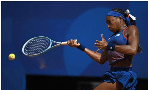
Coco Gauff posted a rare victory over Iga Swiatek to punch her ticket to the semi-finals of the WTA Finals in Riyadh on Tuesday, ensuring Aryna Sabalenka will finish the year as the world number one.