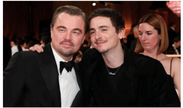
Muling pinatunayan ni Timothée Chalamet ang kanyang charisma at talent para sa Academy Awards matapos niyang makuha ang 83rd Golden Globe Awards para sa Best Actor sa musical-comedy sa kanyang pagganap sa "Marty Supreme" kung saan pinatob ng batang aktor ang mga batikang aktor sa Hollywood tulad nina Leonardo DiCaprio at George Clooney.

Samantala, sa pagsisimula ng awards season tila umiingay na ang pangalan ni Timothée na kakandidato para sa Oscars, na nagpapainit sa kompetisyon sa dating na mga buwan.