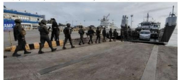
HELPING HAND. Landing craft BRP Manobo (LC-297) is seen here preparing to transport military personnel, rolling cargo, and various military equipment in support of the ASEAN Summit 2026 in Bohol on Monday (Jan. 12, 2026). The Philippine Navy on Thursday announced that its naval units in the Visayas have conducted a series of operations from Jan. 12 to 13.

Ahead of the summits, Cebu will host the ASEAN Foreign Ministers' Retreat (AMM) from Jan. 25 to 29, and the ASEAN Tourism Forum from Jan. 26 to 30. (PNA)