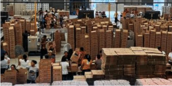
DISASTER RESPONSE. Volunteers help repack family food packs at the Department of Social Welfare and Development's (DSWD) Luzon Disaster Resource Center in Pasay City in this undated photo. The DSWD on Thursday (Jan. 15, 2026) said it is on blue alert status as it monitors the track of Tropical Depression Ada.