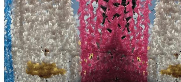
tas sa kanilang mga lugar. Hinihikayat din nila ang mga ito na itaguyod ang isang zero waste na simbahan at lipunan, kung saan ang basura ay minimize at ang mga materyales ay muling ginagamit o nire-recycle.

ating kalikasan. Sa paghahanda ng mga distrito ng Pandacan at Tondo sa Maynila para sa kapistahan, napansin ng grupo ang malawakang paggamit ng mga garland at iba pang dekorasyon na gawa sa bagong plastic. Ang mga ito, sa halip na makatulong sa pagpapaganda ng kapaligiran, ay nagdaragdag lamang sa problema ng basura. Dahil dito, mariin ding hinihimok ng EcoWaste Coalition ang mga parokya at mga opisyal ng barangay na aktibong pigilan ang paggamit ng single-use plastic na banderi-