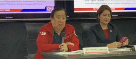
Walang humpay ang Philippine Red Cross sa pagbibigay ng tulong at suporta sa mga kababayan nating labis na naapektuhan ng pag-aalburoto ng Bulkang Mayon sa lalawigan ng Albay.