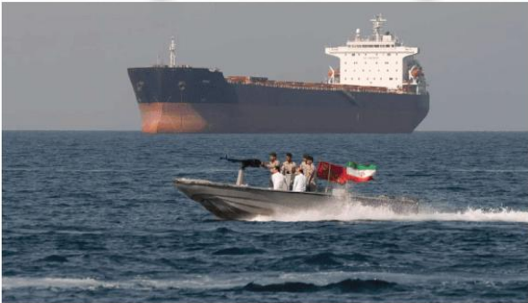
Natukoy na ang halos hindi na makadaan ang ilang oil at gas shipping sa Strait of Hormuz, isa sa mahalagang daanan na nag-uugnay sa oil-rich Persian Gulf sa open sea, habang tumitindi ang tensyon sa rehiyon kung saan pinaigting ng Iran ang mga banta laban sa mga barkong dumaraan dito.

Batay sa ship-tracking data, iilan lamang na sasakyang-pandagat ang umalis sa naturang waterway nitong Linggo, at wala umano ng nakikitang pumapasok.