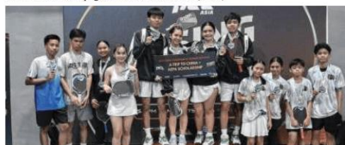
WINNERS. Members of Team Velaris display their gold medals, replica of scholarship development grant and ticket to the Pickleball Champions League Asia Grand Finals in China after ruling the PCL Rising Stars U19 Sectional Tournament in Davao City on Sunday (March 1, 2026). Team Velaris beat SABR, 23-21.

Another tournament, the Net and Paddle Tournament, is slated in Cebu City on March 11 to 15. For details, visit https://picklefest.kosmas.com.ph/ or the official Facebook page of Pickle Fest 2026. (PNA)