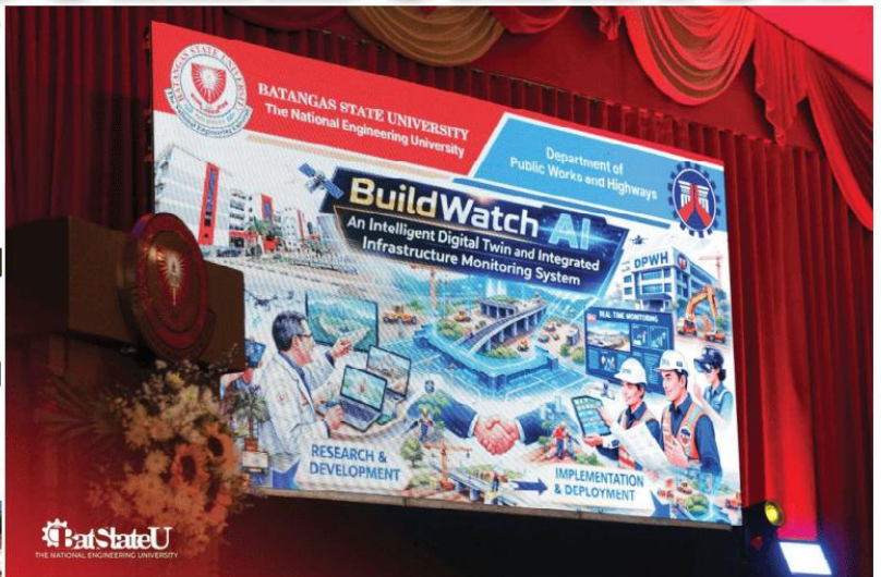
BATANGAS CITY—Department of Public Works and Highways (DPWH) in partnership with Batangas State University, The National Engineering University (BatStateU The NEU), successfully conducted the third run of the DPWH Campus Job Fair on February 23 at the Pablo Borbon Campus—marking the first time the initiative was conducted in a state university and the first to be held outside the National Capital Region.